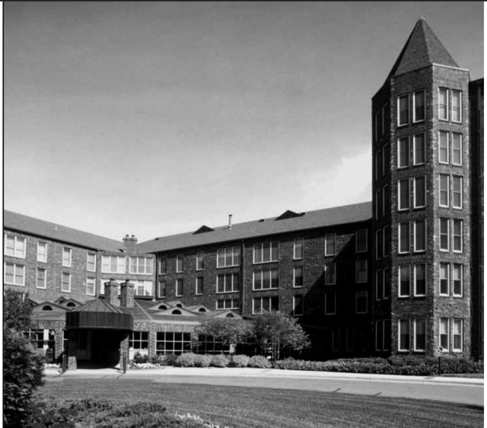
Natural gas central humidifier, 300,000 BTU with four burners; 120-unit wing of Becketwood high-rise in Minneapolis.

Residents of the east wing of Becketwood high-rise in Minneapolis were among the first to sing the praises of a natural gas-fired humidification system installed in their building in January 1996. DRISTEEM Humidifier of Eden Prairie developed and provided the unit and CenterPoint Energy covered costs to install it.